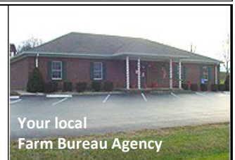
Your local Farm Bureau Agency