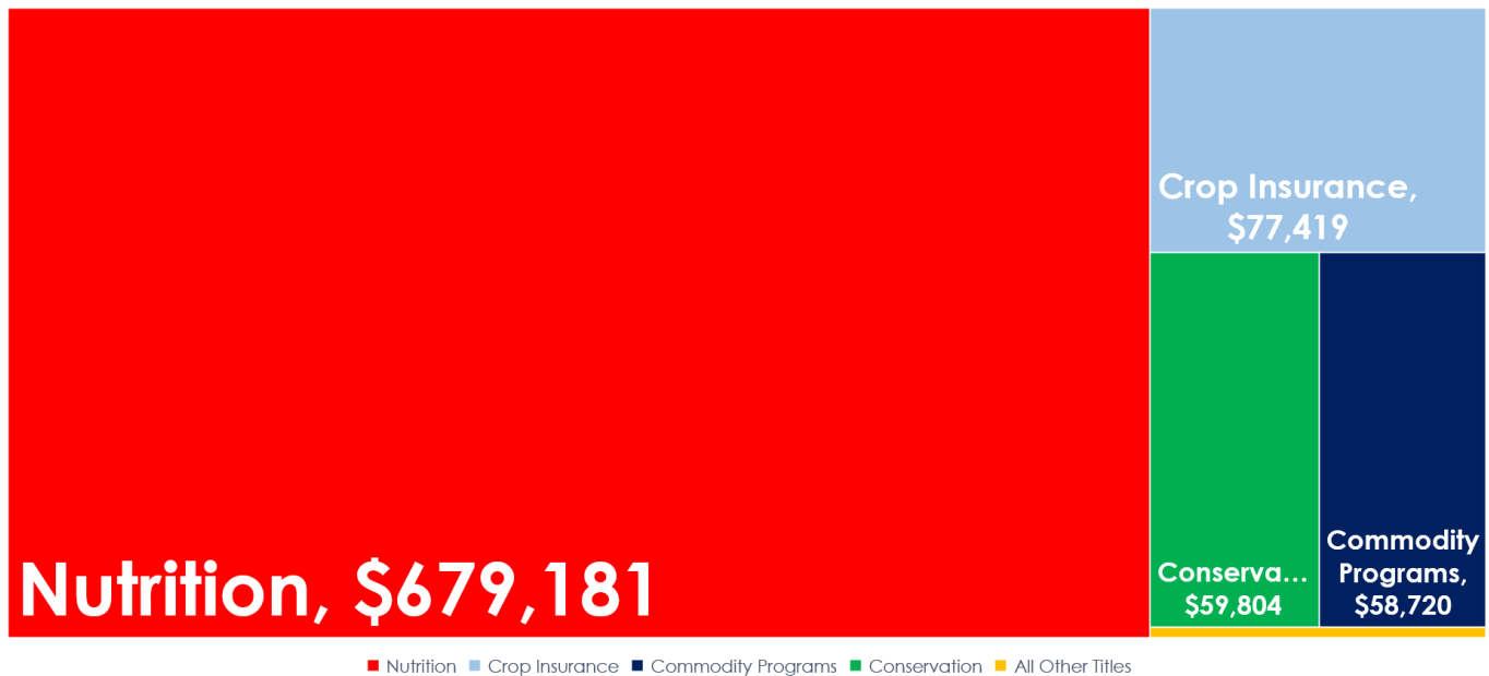
Figure 1. 2014 Farm Bill Spending, June 2017 Congressional Budget Office 10-Year Projections

At the time of passage, the 2014 Farm Bill was projected to cost $956 billion over the next 10 years (FY2014-FY2023). The bill also made a $23 billion contribution to reduce the deficit over 10 years. It was the only reauthorization bill in that session of Congress that voluntarily offered savings. These difficult cuts resulted from hard choices made in order to reform and reduce the farm safety net, conservation initiatives, and nutrition assistance.