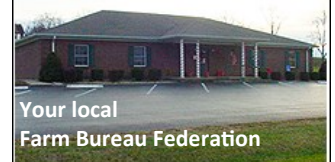
Your local Farm Bureau Federation