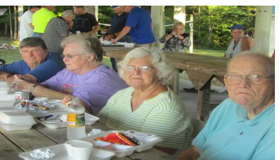
Snapshots of the crowd at the annual meeting