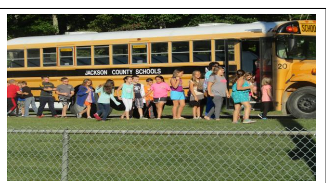
Students arriving for the Field Day