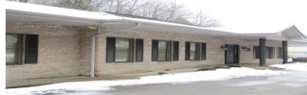
JACKSON COUNTY OFFICE